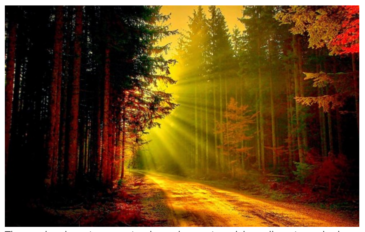
Those who do not encounter inward or outward impediments and who see that