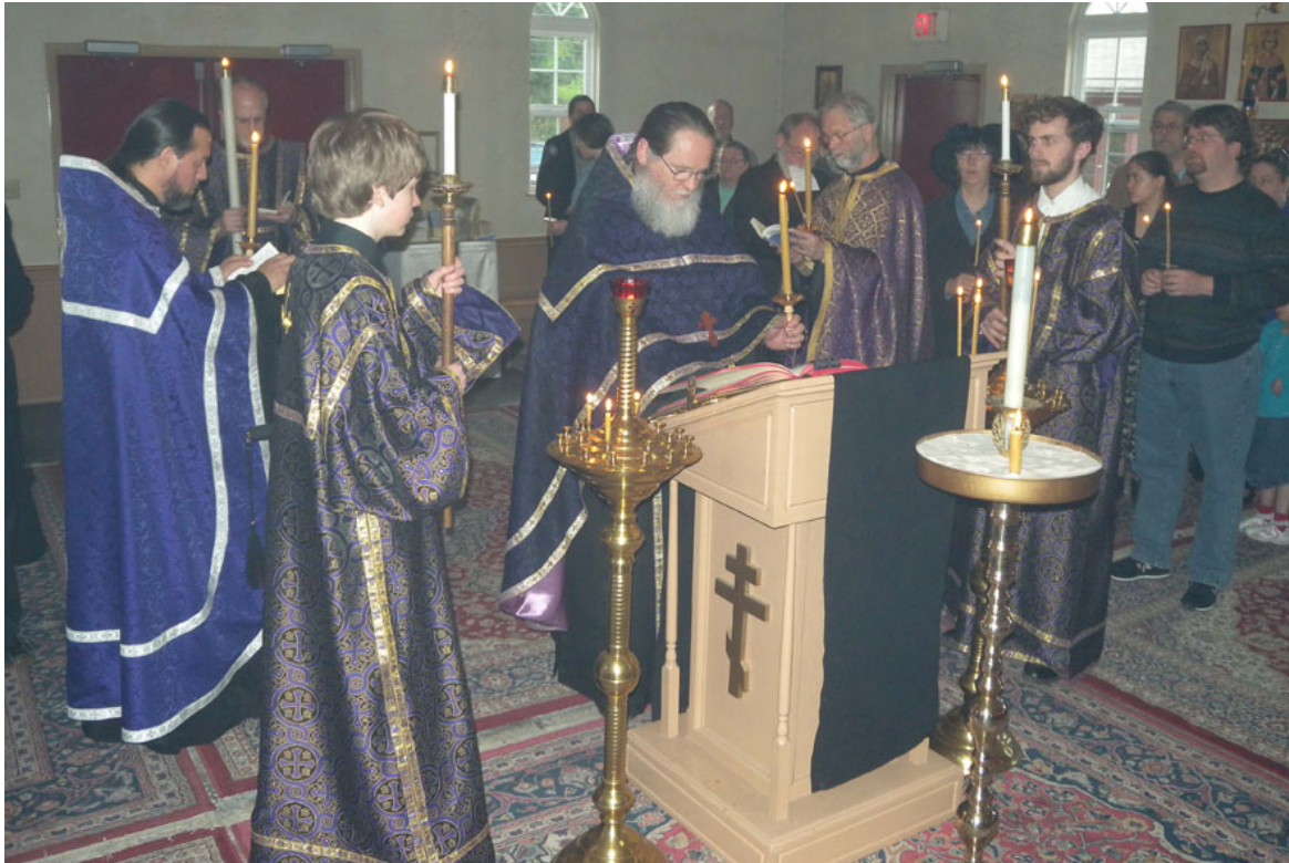
Holy Week Service

get started on Holy Week, to put things into perspective.