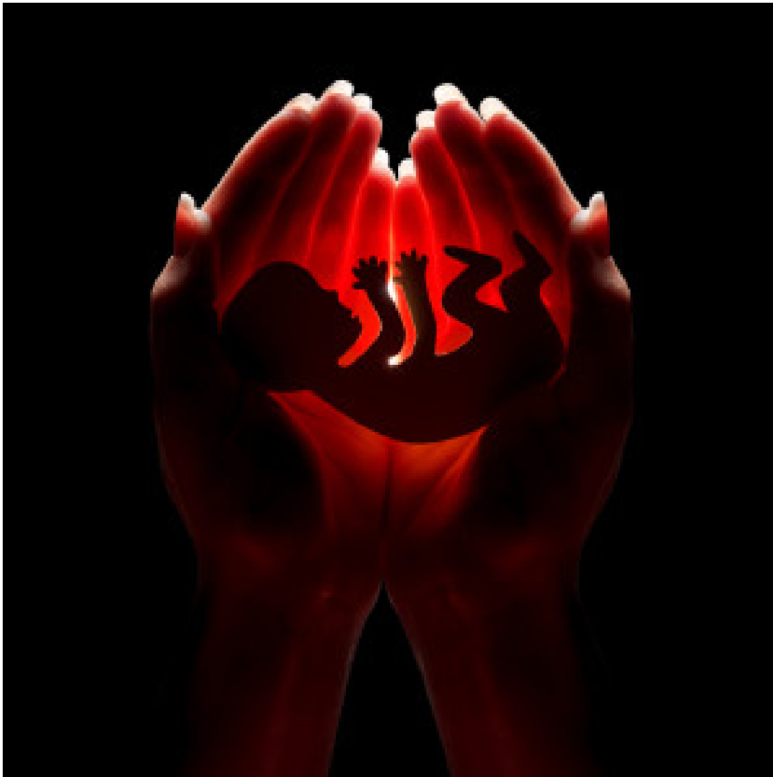
embryo silhouette in woman hand

The very moral foundations of society are being subjected to doubt, and there is no open objection... ..the whole meaning and context of life is being reduced to the seeking of material goals, external success, and the gratification of the senses.....As a horrible symbol of this moral decay I cite the legalization of abortion, this frightening transgression of the most sacred of all Divine Commandments.