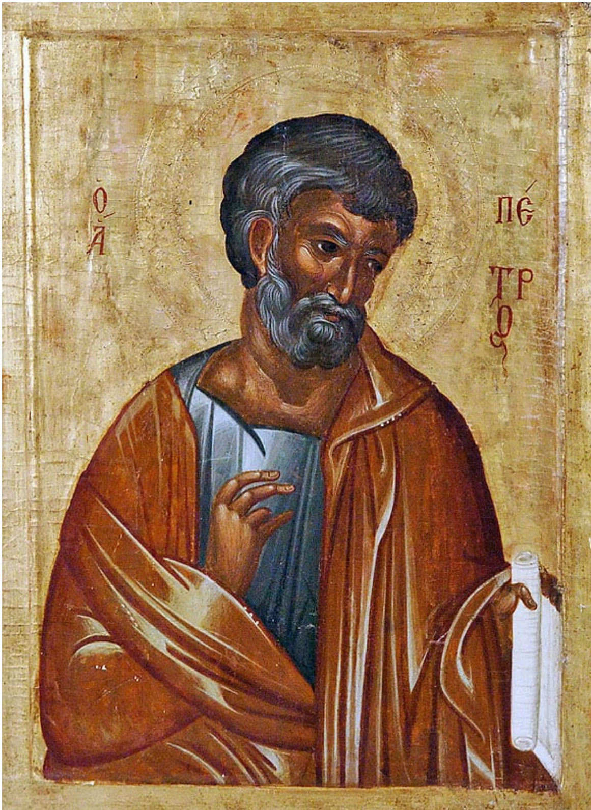
Apostle Peter, byzantine icon, 15th Century

It's not clear in the New Testament exactly when Christ names him Simon Cephas, i.e. rock or stone . According to Matthew (16, 18), this naming occurred at the time of Peter's confession to Philip in Caesarea. According to Mark (3, 16) and Luke (6, 14), the change of name from Simon to Peter is mentioned at the beginning of the catalogue of the twelve apostles, when Jesus gathered them together and