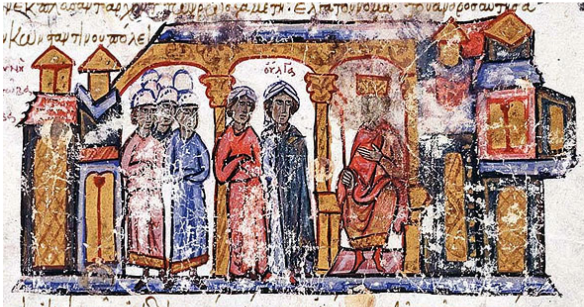
Saint Olga received by Emperor Constantine VII, byzantine manuscript, 12th century

read that after the murder of her husband, prince of Kiev Igor, she behaved with incredible cruelty and avenged not only to the killers but also to the whole tribe to which they belonged.