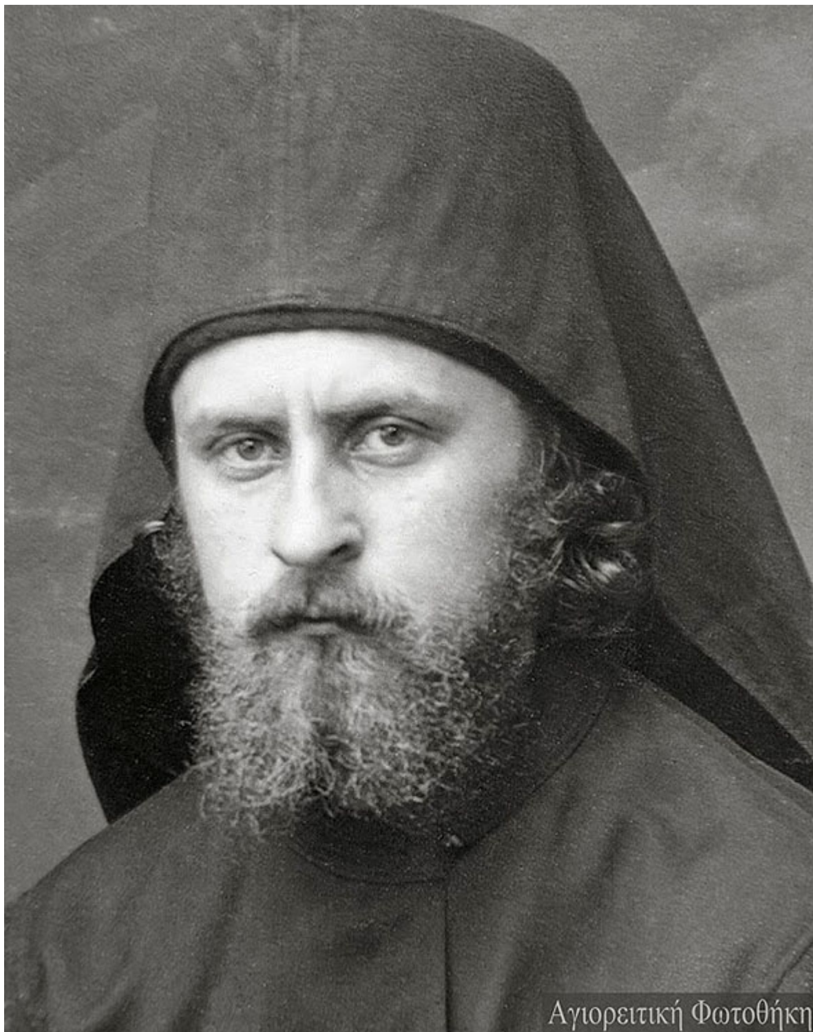
Elder Sophrony as a young monk. Monastery of Saint Panteleimon, Holy Mountain