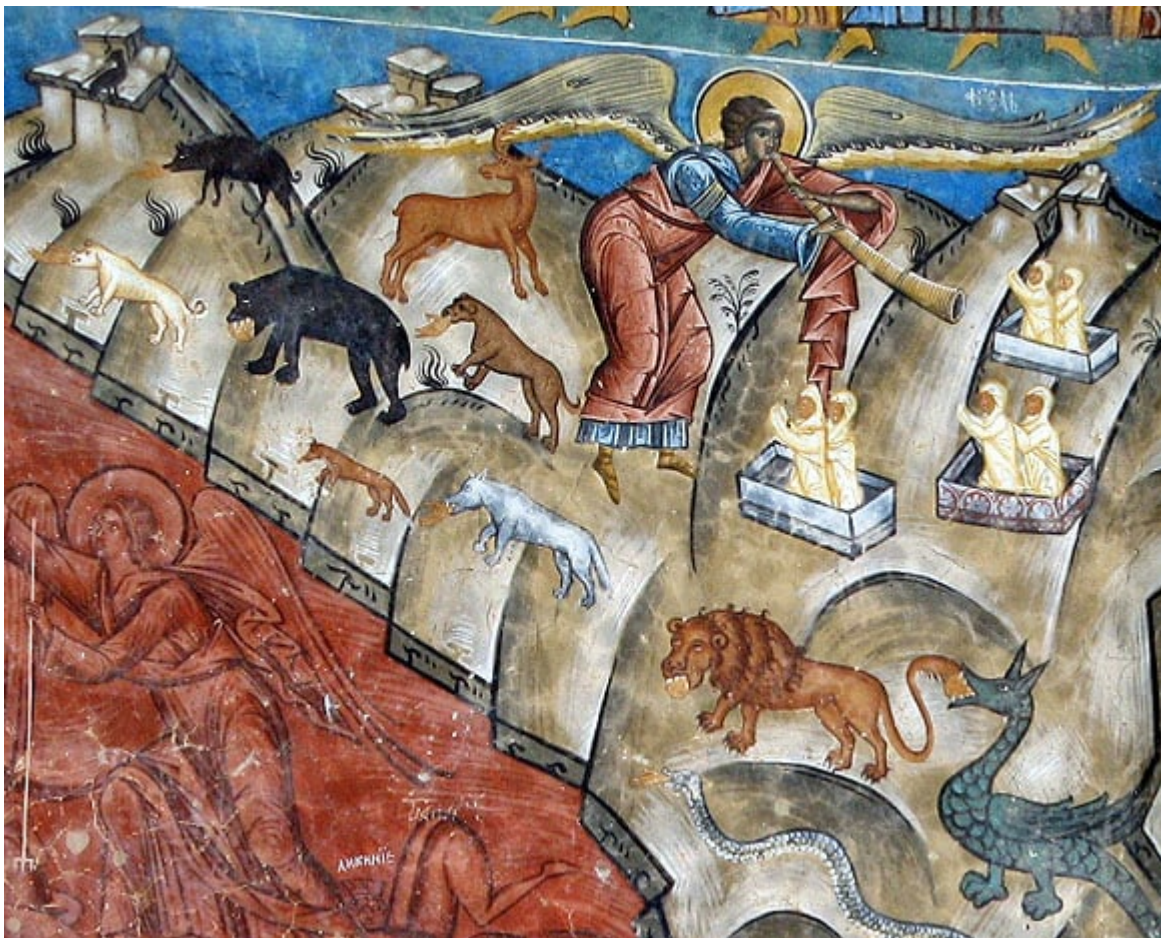
The Resurrection, fresco from Voronetz Monastery, Romania, 1547

have eaten them, it is evident, they say, that the human body-parts which served as nourishment for the animals which ate them, then pass into the bodies of other people. This is because the animals which, in the meantime, fed off them, carry the nutriment into the people whose food they become [...] and from these things they establish – supposedly – the impossibility of the resurrection, on the grounds that the same parts cannot rise again in two different bodies, because either the bodies of the former possessors cannot be reconstituted, since the parts which composed them have now passed into others; or, if they have been restored to their original ‘owners’, then the bodies of the last possessors will be deficient.