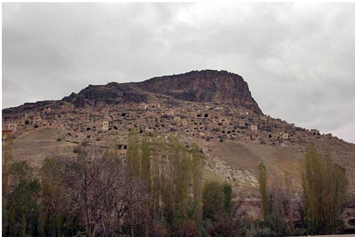
The now abandoned village of Neapolis in Cappadocia

On 20 August, after he had rejected new proposals from his master, he was taken an hour's journey out of town. In answer to the last question of the executioners, he began to pray. The former thought he was mocking them so they stoned him and then hanged him from a birch tree. When they threw him into the hole they had dug for him there, a fierce storm arose, which spread panic among the Turks. The saint's relics were found later, after a revelation and, in 1923, refugees from Asia Minor took them to Thessaloniki, to the church of Saint Katherine. As for the birch tree where Saint Theocharis was hanged, it became a place of pilgrimage for Christians and Muslims alike.