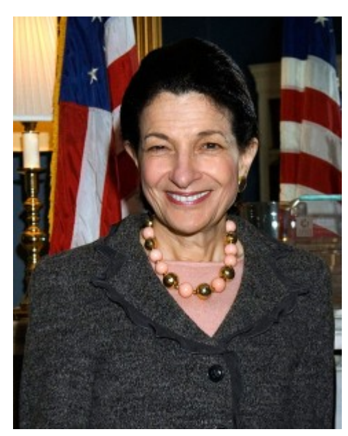
Senator Olympia Snowe

I have mentioned the worry that the heavy-handedness of a few bishops will raise the old nativist specter that the pope will try to control Catholic politicians. But there is another and deeper consideration here. To what extent can a person who is seriously at odds with the direction of a culture sign off on the most murderous aspects of that culture, in order to accomplish lesser goods? In other words, in order to raise the minimum wage you vote (because it's the Democratic Party line) to allow late-term abortions? Some months ago, the Orthodox Peace Fellowship sent letters to Senators Paul Sarbanes (D-Md.) and Olympia Snowe (R-Maine), both Orthodox who cast consistently prochoice votes, challenging their record in this regard, and asking for some explanation of their position. The letters remain unanswered.