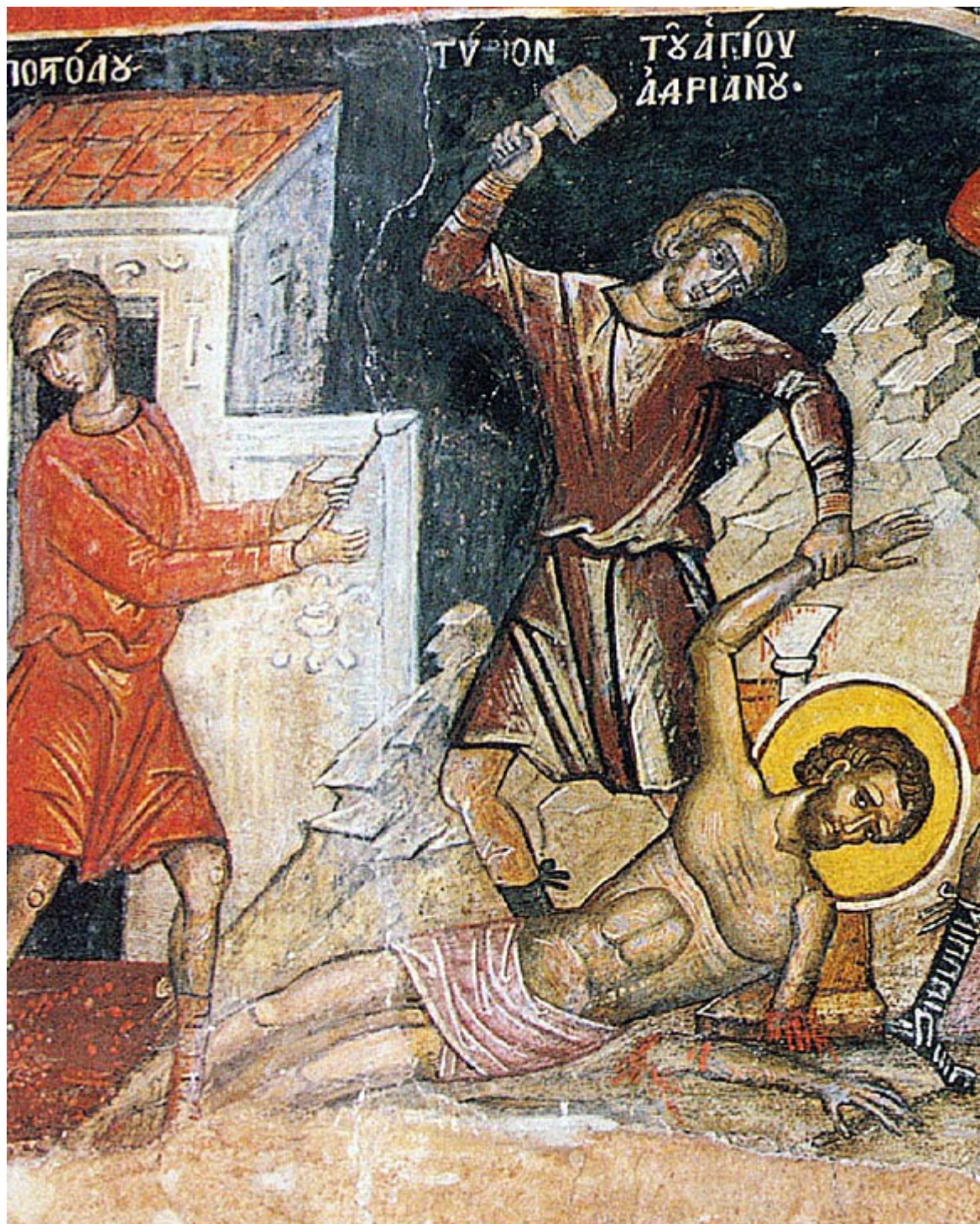
The martyrdom of Saint Adrian, fresco from Monastery of Dionysiou, Holy Mountain Athos, 1547

other martyrs. Of course, the first to suffer was Adrian. In fact, his wife, Natalia, was the one who stretched each of his limbs on the anvil, beseeching, on the one hand, the executioner to strike powerfully with the hammer against the sharp edge and, on the other, encouraging and strengthening her husband, Adrian to bear the pain with fortitude and not to betray his struggle for Christ through cowardice.