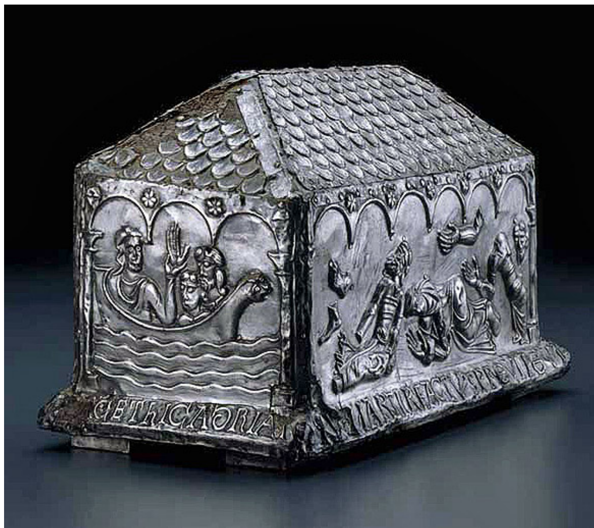
Reliquary containing the hand of Martyr Adrian, now at The Art Institute of Chicago