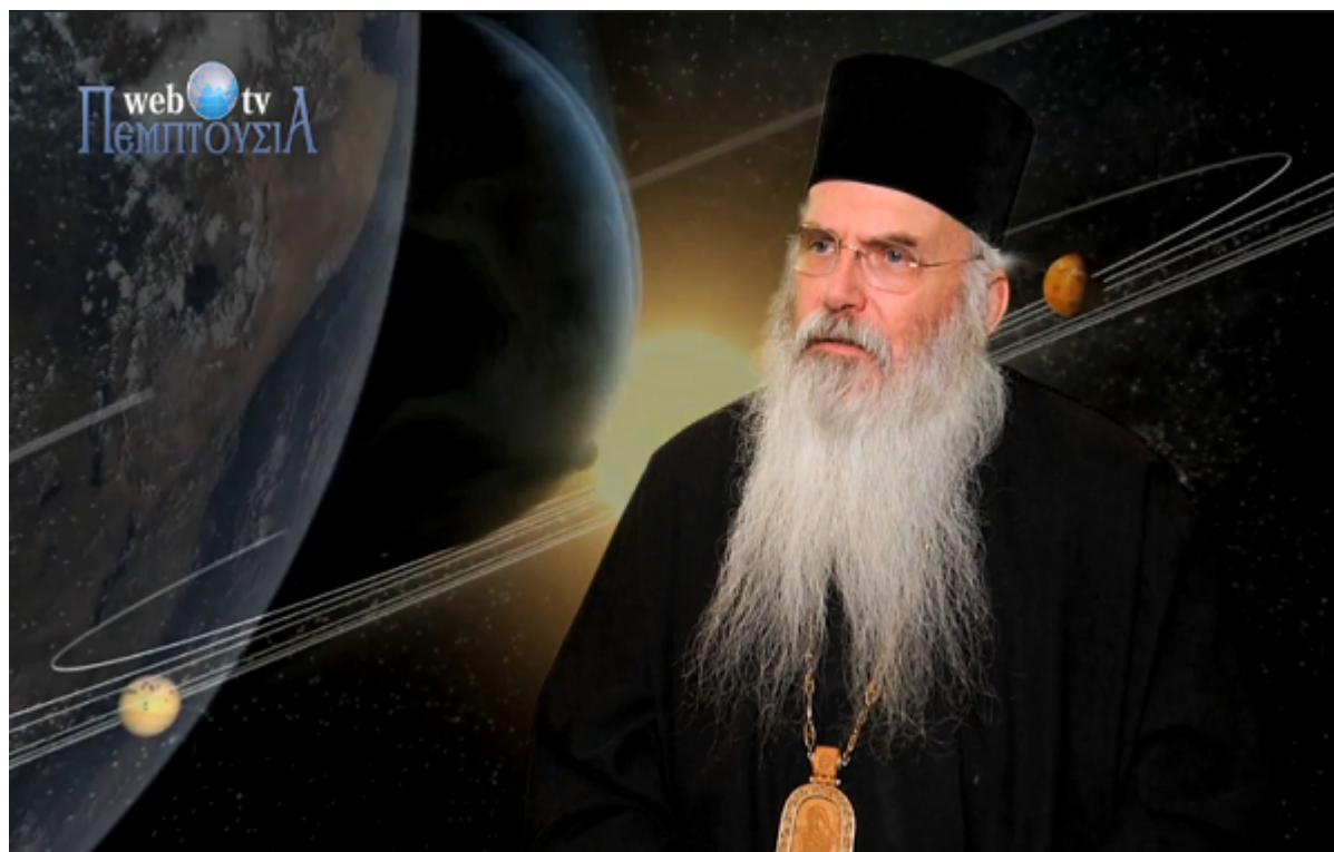
Metropolitan of Mesogaia and Lavreotiki Nikolaos

The Church of Greece has also made a significant contribution by setting up a special bioethics committee of the Holy Synod [14] . Another important initiative is the foundation of the first Center of Biomedical Ethics and Deontology [15] by the then archimandrite and now metropolitan of Mesogaia and Lavreotiki Nikolaos Hadjinikolaou.