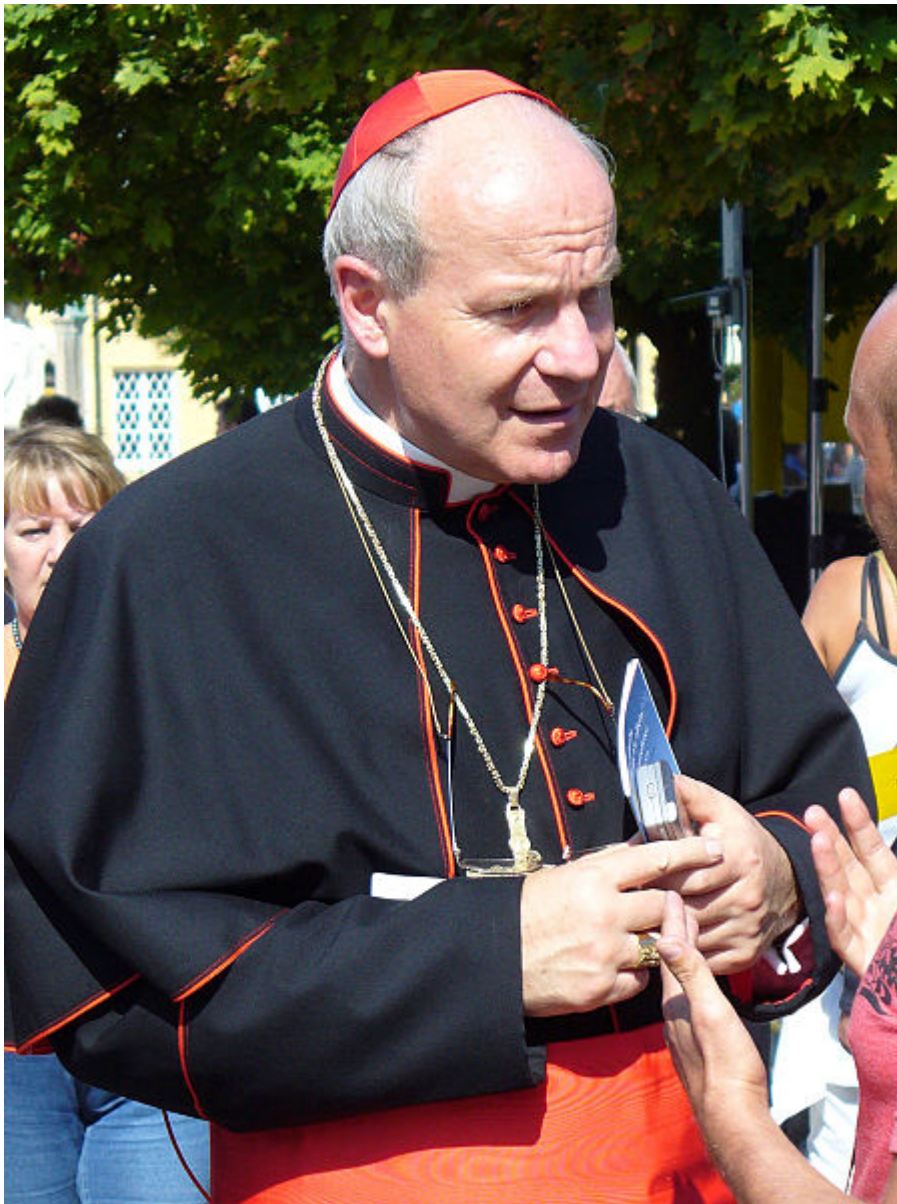
Cardinal Christoph Schönborn

The problem with the God rejected by Darwinian atheists and the God of those who believe in intelligent design is that neither is particularly biblical. (By the way, I think it is fair of those who believe in intelligent design to complain that they are not, as some allege, a wedge into the schools that will lead eventually to teaching biblical literalism. This is not, in fact, part of their argument, and the intelligent designer they posit has little to do with the God of the Bible.) The intelligent designer seen by both camps—rejected by one, accepted by the other—is essentially the God of the deists, a generally benign designer compelled to create the best of all possible worlds, a world in which profound flaws and seemingly mad design would be unthinkable.