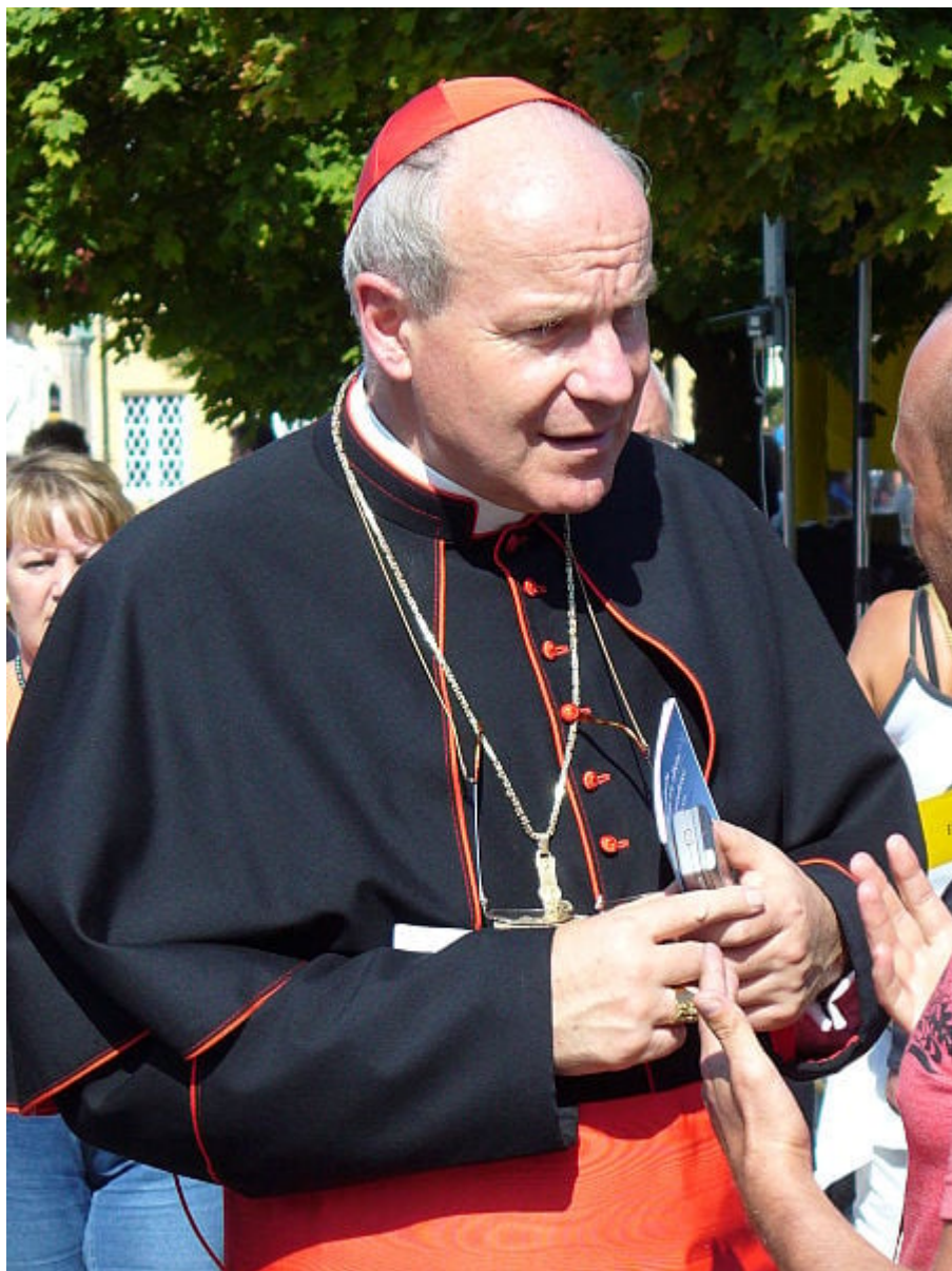
Cardinal Christoph Schönborn

The problem with the God rejected by Darwinian atheists and the God of those who believe in intelligent design is that neither is particularly biblical. (By the way, I think it is fair of those who believe in intelligent design to complain that they are not, as some allege, a wedge into the schools that will lead eventually to teaching biblical literalism. This is not, in fact, part of their argument, and the intelligent designer they posit has little to do with the God of the Bible.) The intelligent designer seen by both camps—rejected by one, accepted by the other—is essentially the God of the deists, a generally benign designer compelled to create the best of all possible worlds, a world in which profound flaws and seemingly mad design would be unthinkable.