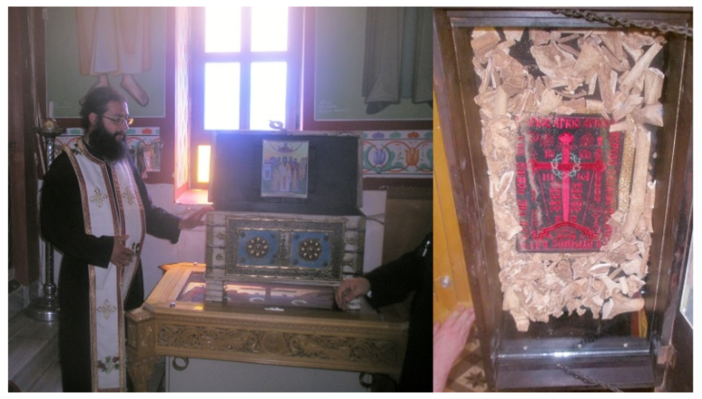
c) the beautifully-wrought reliquary of the five other martyrs, a gift of the late Presvytera Anthi Pettas.