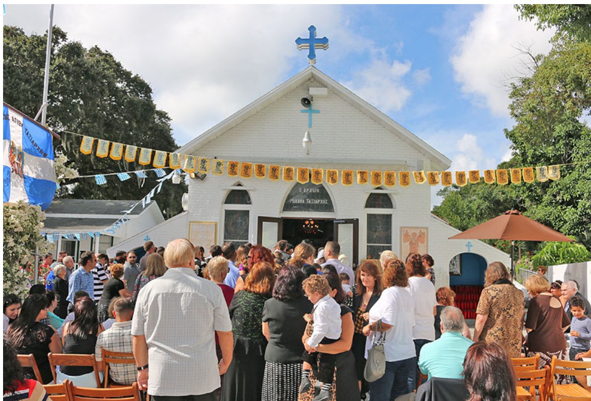
The Shrine of Archangel Michael Taxiarchis, Tarpon Springs, FL.