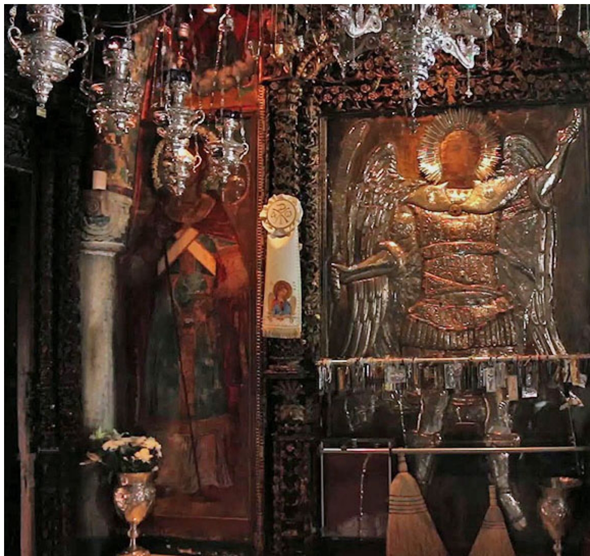
The Icon of Archangel Michael from Panormitis Monastery in Symi, Greece

The 17 th century church, located in the center of the monastery’s courtyard, is filled with “tamata” or offerings of oil lanterns and gold, much of which has been pinned in front of a 2-meter high silver-leafed icon of the Panormiti.