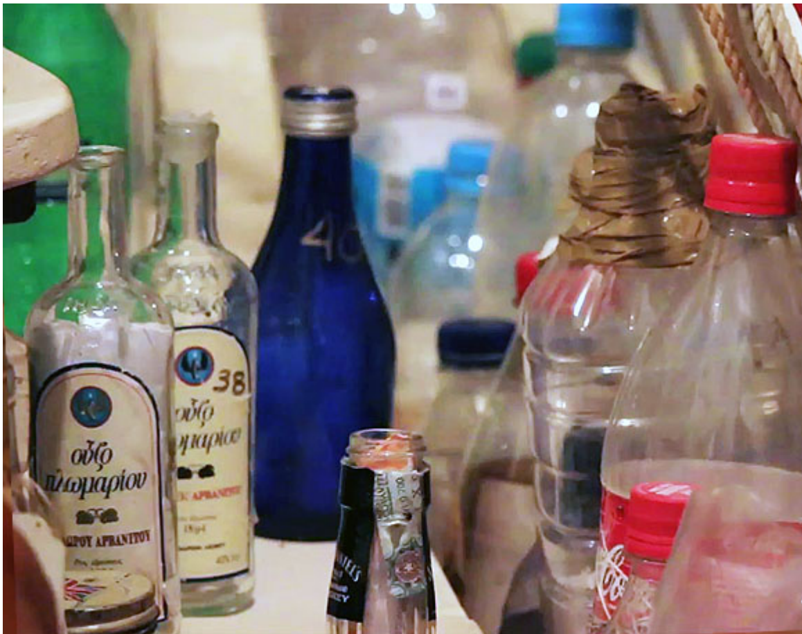
Bottles: Offerings made to Panormitis Monastery by Sea

“There are people nowadays as well as in the past, who couldn’t come here for some reason, so they would send through the waves of the sea a small bottle with a note or a letter in which they would write the problem that either they themselves were having or that of their loved ones, and many times there is money inside these bottles, even jewelry, which they would send with this uncertain way to the Archangel,” he said. Dozens of these bottles from all over the world are now on display inside a museum at the monastery.