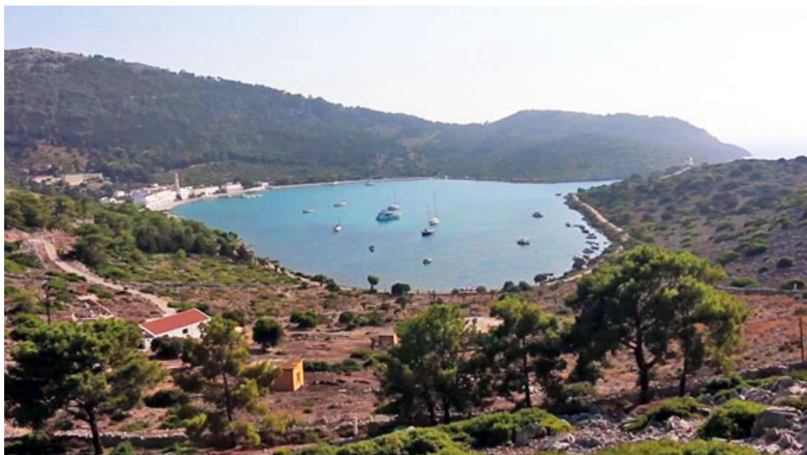
Panormitis Bay in Symi, Greece