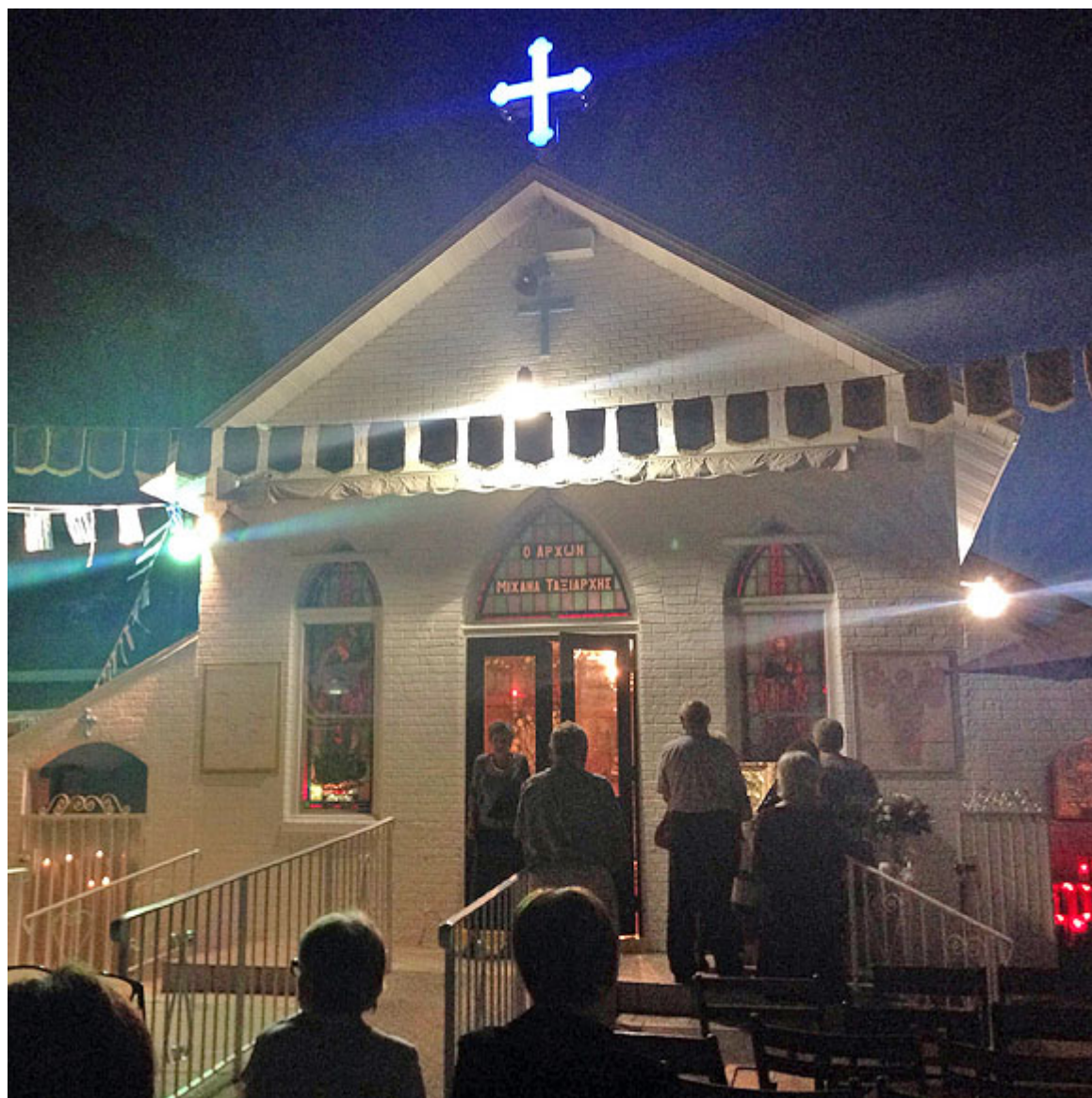
Archangel Michael's Church in Tarpon Springs, FL.

The floors have just been shined, and the little white church dedicated to Archangel Michael in Tarpon Springs is about to get a new front door.