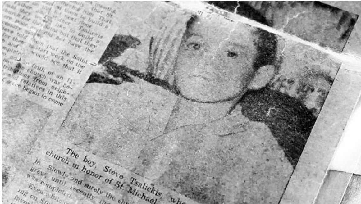
Newspaper Article after Tarpon Springs Miracle in 1939

The Panormitis in 1937, a centuries-old monastery located off the coast of Greece, built by the Symian people in honor of their island's protector, Archangel Michael.