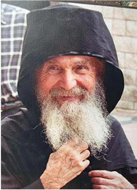
Elder Ephraim of Arizona

The Divine Liturgy, what a splendor indeed! Man has been honored by God in such a way that He Himself comes down to earth with His Angelic Orders every time there is a Liturgy, in order to nurture man with His Most Holy Body and His Most Precious Blood! For He has given us everything. Is there anything physical or spiritual, perishable or everlasting, that has not been offered to us? None! Is there anything superior to His Most Holy Body and Blood, which is given to us on a daily basis? There is certainly not. God has enabled man, who is full of soil and dirt, to serve the Divine Liturgy. So priceless is the Divine Love that just a tiny drop exceeds any earthly, physical and secular love.