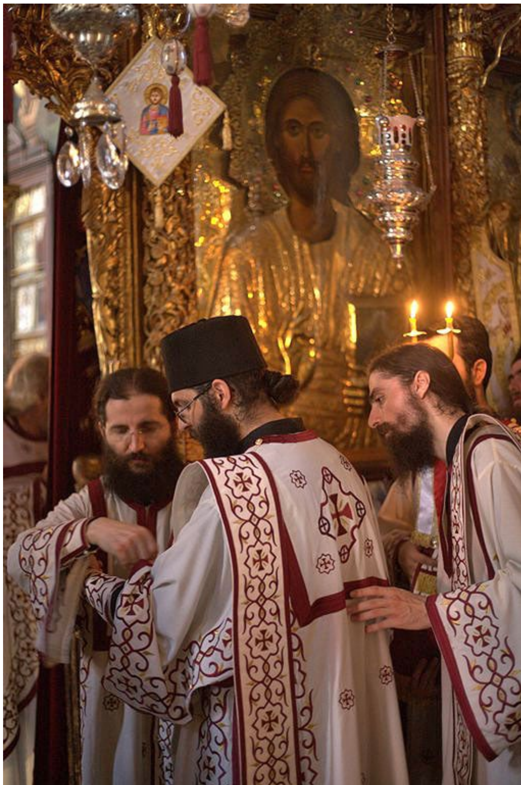
Deacons, Monastery of Vatopedi, 2011

This ministerial human trinity within ancient Israel and the Church obviously reflects the Divine Trinity. In nature, the triangle is the strongest and most stable structure there is. If deacons are missing from our parishes, then what may that forebode for the strength and stability of our Church? The triune ministry of bishop, priest, and deacon also reflects three major archetypes of Christ: Sovereign-king (John 1:49) or high priest (Hebrews 3:1), Shepherd (John 10:11), and Servant