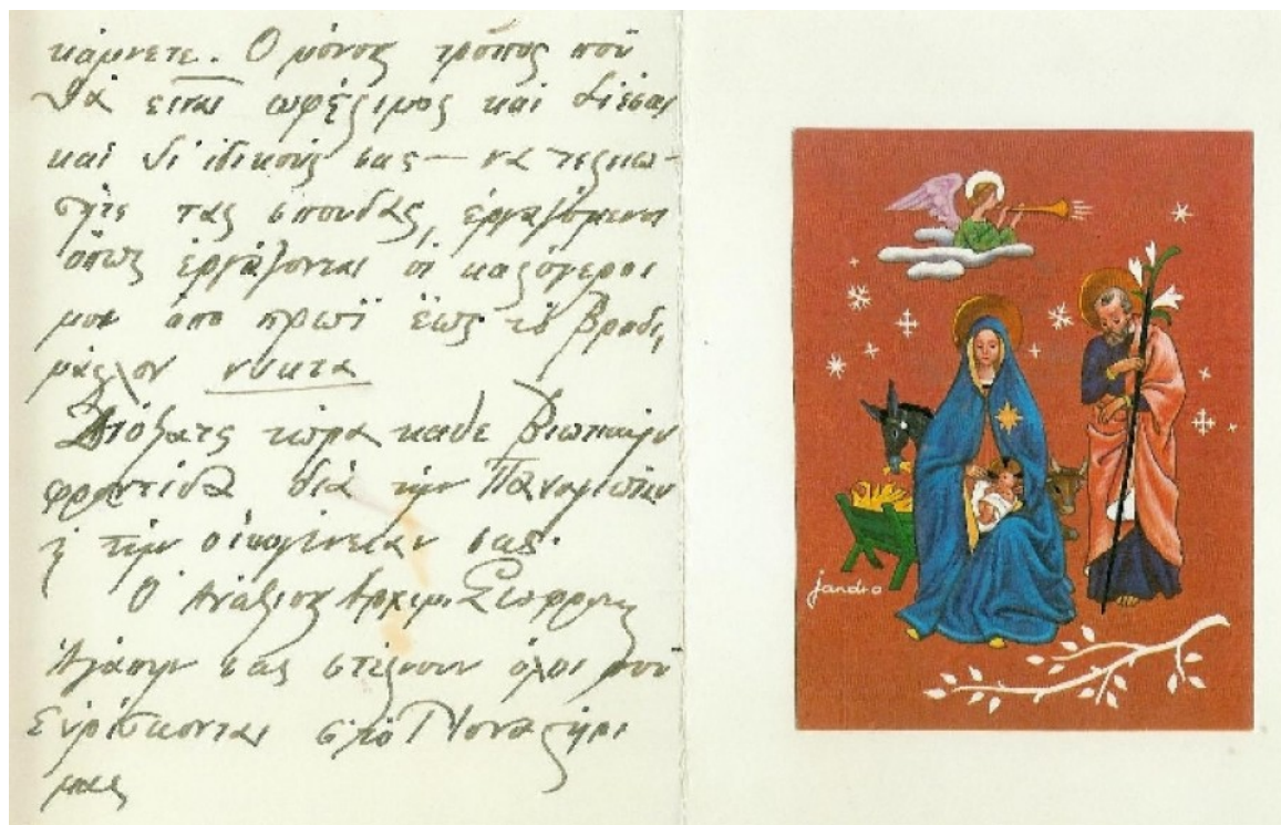
The outside of the card