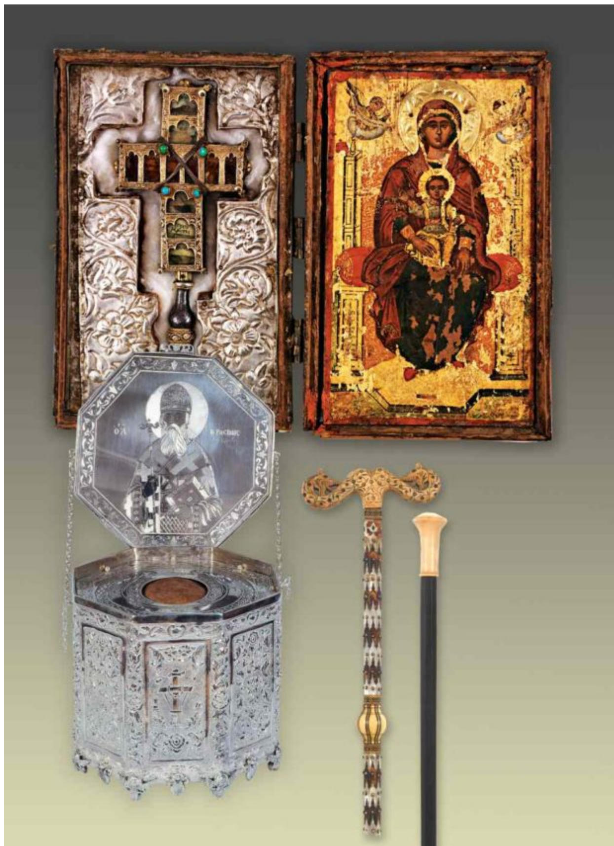
Slide_(6×6)-206-02- 001 017