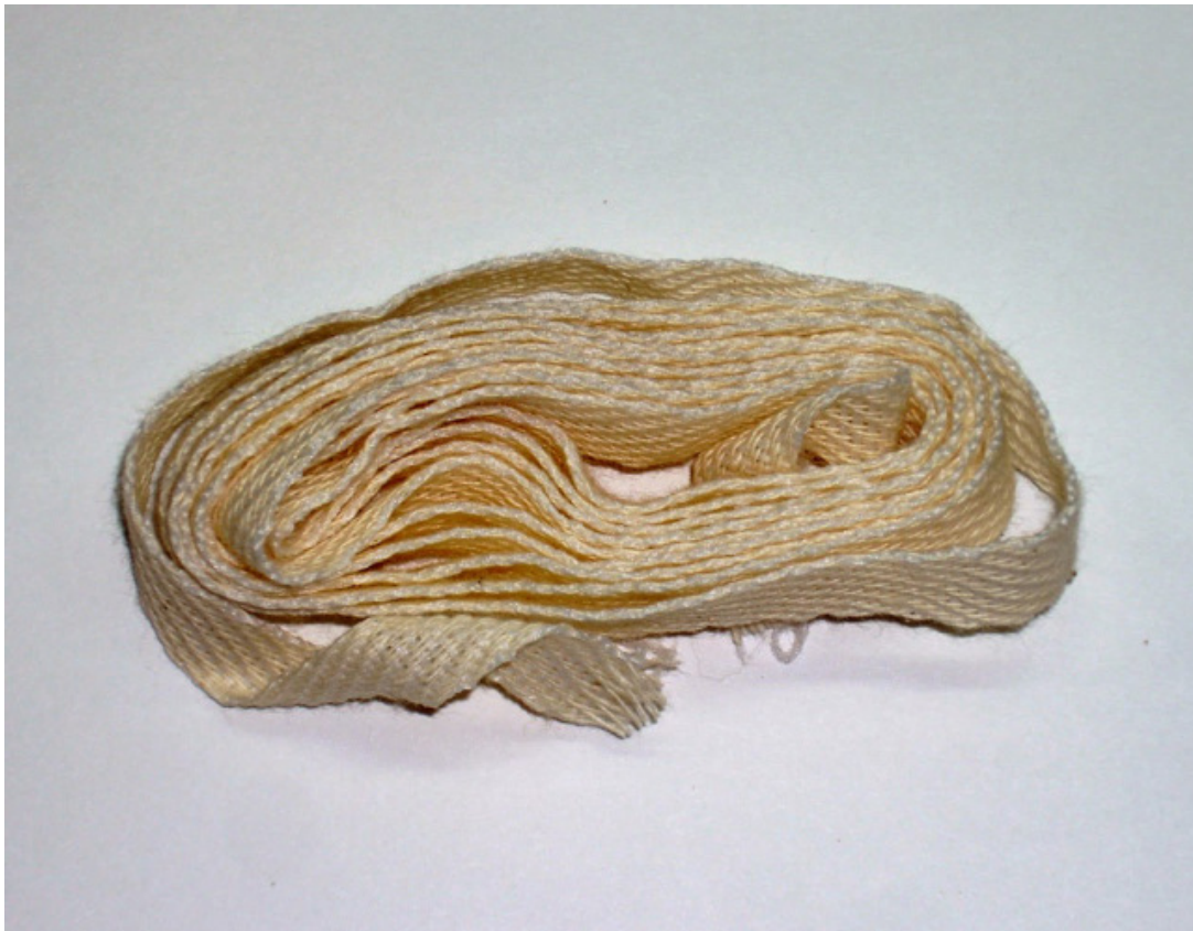
This ribbon has been blessed through contact with the Holy Belt of the Most Holy Theotokos, which is kept at the Monastery of Vatopaidi. The Holy Belt was a gift to the Monastery from the Byzantine emperor John Cantecuzenus.

Through these ribbons and by the grace of the Most Holy Mother of God – to Whom our Monastery is dedicated – many miraculous events have occurred. Persons suffering from cancer and other illnesses have been restored to health. More particularly however, sterile persons, as well as others unsuccessful in bearing children, have been able to conceive and bear healthy children.