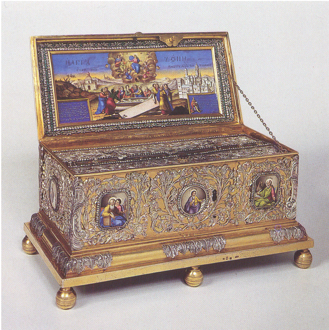
The Venerable Belt of the Mother of God

wearing the holy ribbon. A faithful spiritual life with continual repentance and partaking in the Holy Mysteries of the Orthodox Church must be a lifelong practice, as this constitutes the only way of communion and ultimately union with God in this present world and in the age to come.