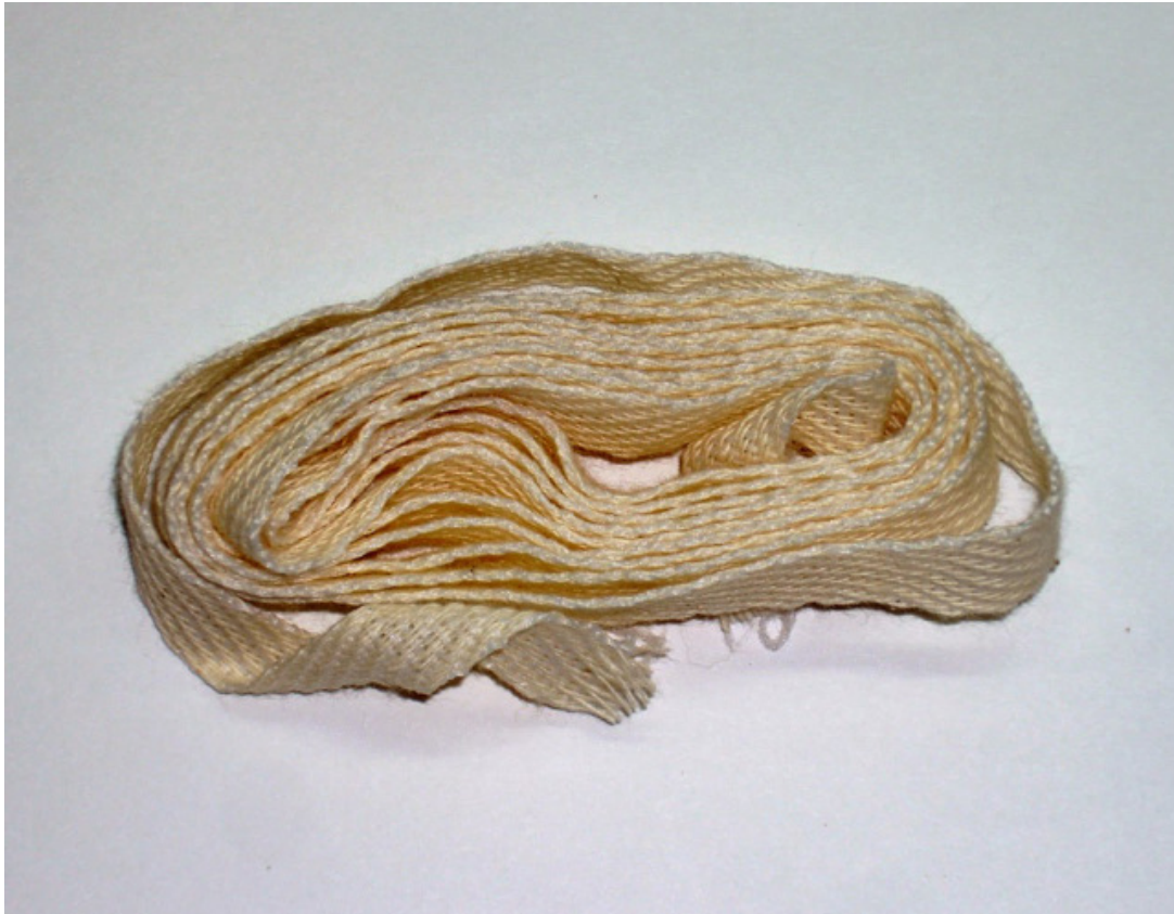
This ribbon has been blessed through contact with the Holy Belt of the Most Holy Theotokos, which is kept at the Monastery of Vatopaidi. The Holy Belt was a gift to the Monastery from the Byzantine emperor John Cantecuzenus.

Through these ribbons and by the grace of the Most Holy Mother of God – to Whom our Monastery is dedicated – many miraculous events have occurred. Persons suffering from cancer and other illnesses have been restored to health. More particularly however, sterile persons, as well as others unsuccessful in bearing children, have been able to conceive and bear healthy children.