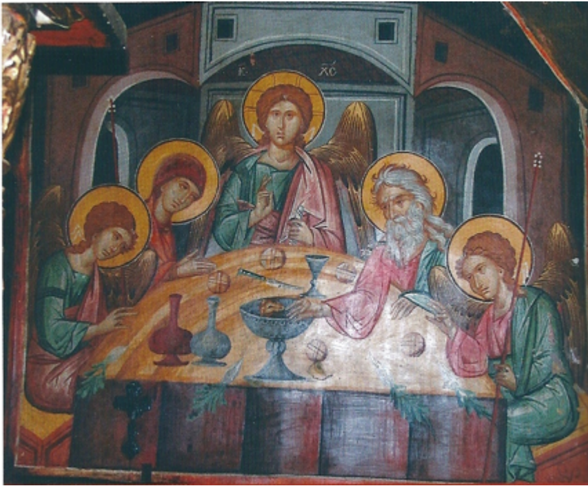
Fresco of the Hospitality of Abraham, Church of Panagia Hrisokourdiotissa, Cyprus, 16 th Century

Origen also, although it has been suggested that the exegesis of the three men as a type of the Trinity began with him, saw in the narrative a manifestation of the Word accompanied by two angels: