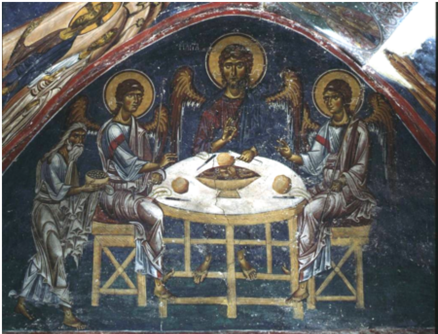
12 th century fresco of the Hospitality of Abraham, Monastery of St John the Evangelist, Patmos

The same is implied by St Romanos the Melodist in his Kontakion on the Holy Theophany: