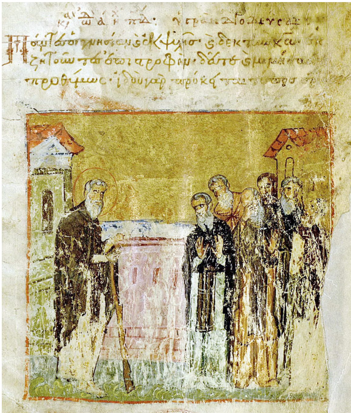
Saint John of the ladder with his companions, 11th Century byzantine manuscript

Great Lent is a time of renewal when everything, as is the case every spring, makes a new beginning and our sunless lives are again brightened by all the intensity that God can give us, making us His confidants, through the Holy Sacraments and His costly gifts. This reconciliation is a joy; for both us and for God - a new beginning.