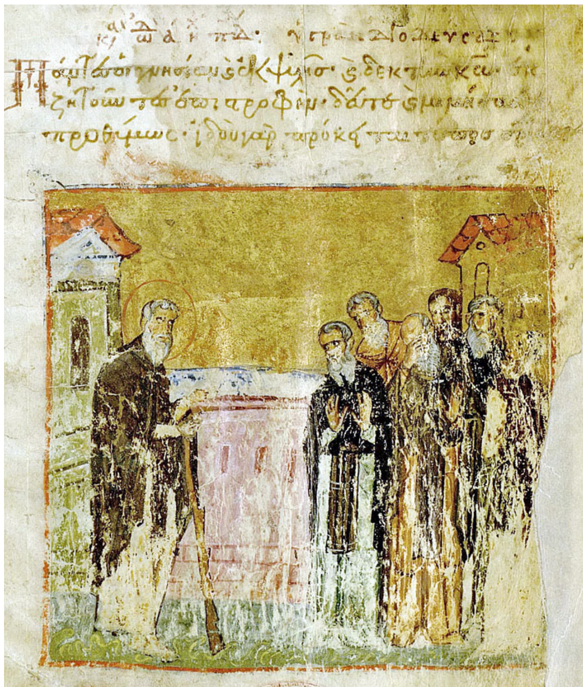
Saint John of the ladder with his companions, 11th Century byzantine manuscript

Great Lent is a time of renewal when everything, as is the case every spring, makes a new beginning and our sunless lives are again brightened by all the intensity that God can give us, making us His confidants, through the Holy Sacraments and His costly gifts. This reconciliation is a joy; for both us and for God – a new beginning.