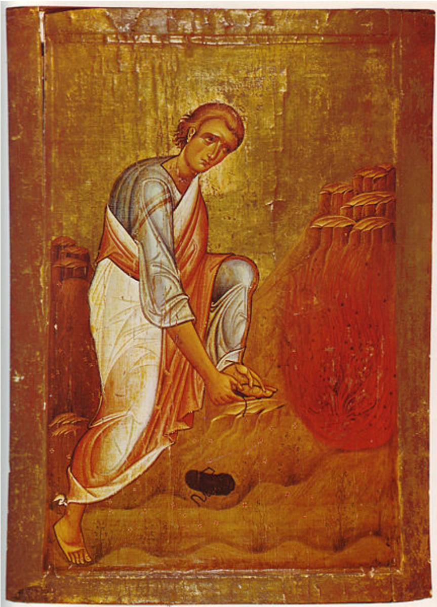
Icon of Moses and the burning bush

“If you believed Moses, you would believe me; for he wrote of me» (John 5:46)