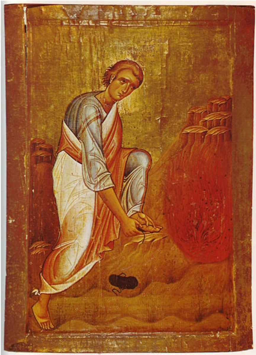
Icon of Moses and the burning bush

“If you believed Moses, you would believe me; for he wrote of me» (John 5:46)