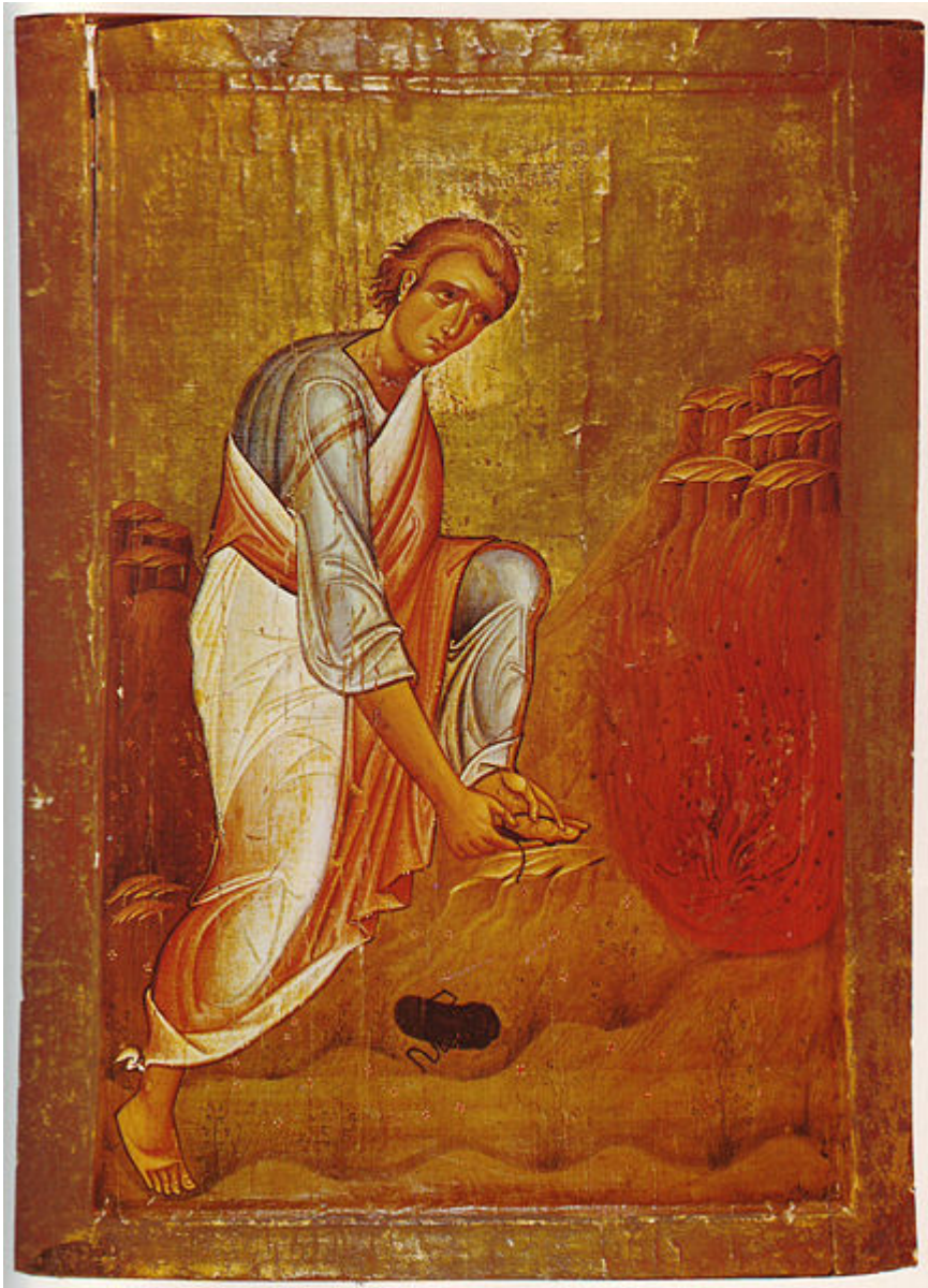
Icon of Moses and the burning bush

“If you believed Moses, you would believe me; for he wrote of me» (John 5:46)