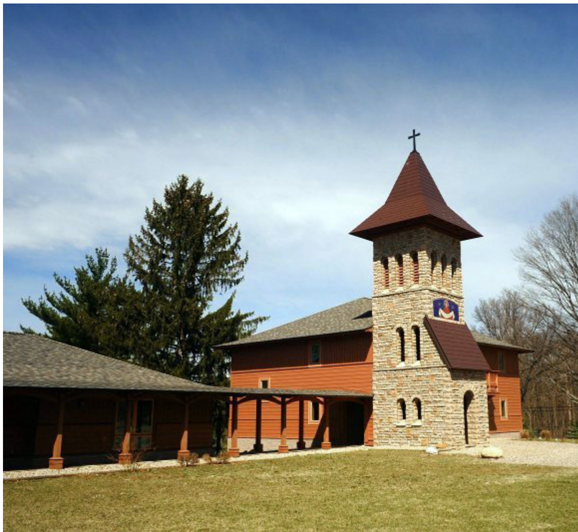
The monastery of the Dormition of the Mother of God in Rives Junction, Michigan

From 1979 to 1982 he was occupied with the functions of a parish priest at Holy Trinity Church in Youngstown, Ohio. From Youngstown he was assigned to the St. George Cathedral in Southfield, Michigan, and from there, as priest and spiritual father to the Holy Monastery of the Transfiguration in Ellwood City, Pennsylvania. After five years in Ellwood City, in 1988, he retired to the monastery of the Dormition of the Mother of God in Rives Junction, Michigan where he remained for the rest of his life. The next 15 years at the Dormition Monastery were filled by the complete cycle of liturgical services, counseling, teaching and pastoral ministry. Up until the past two years he never missed a service, and maintained his prayer rule intact: rising at 2:00 am, reading morning prayers, preparing for church and to be in church at 5:00 am sharp. Most of the same schedule he has maintained even after he was diagnosed with prostate cancer, with the exception that, as time went by, he no longer had the strength to attend all the services.