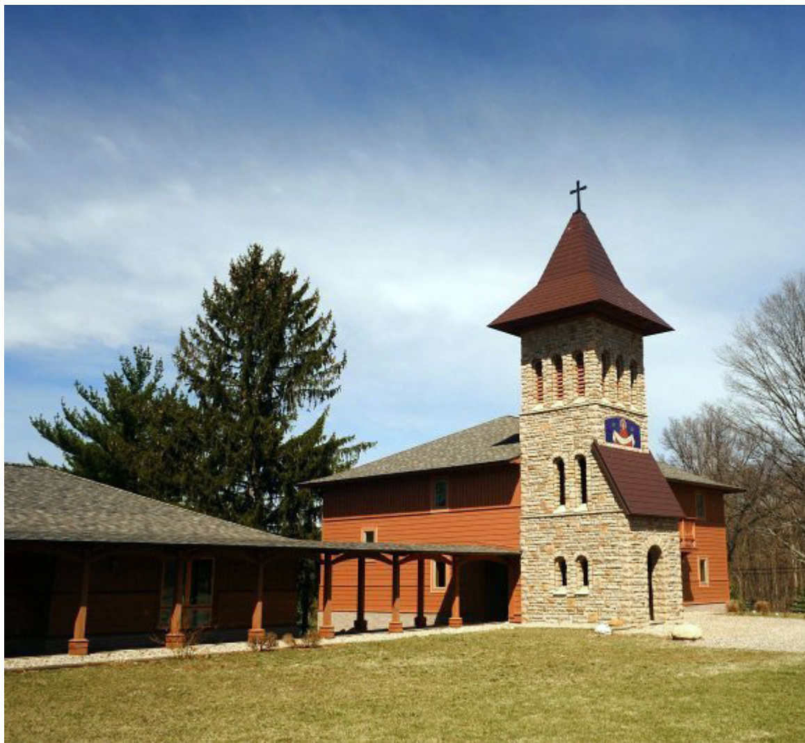
The monastery of the Dormition of the Mother of God in Rives Junction, Michigan

From 1979 to 1982 he was occupied with the functions of a parish priest at Holy Trinity Church in Youngstown, Ohio. From Youngstown he was assigned to the St. George Cathedral in Southfield, Michigan, and from there, as priest and spiritual father to the Holy Monastery of the Transfiguration in Ellwood City, Pennsylvania. After five years in Ellwood City, in 1988, he retired to the monastery of the Dormition of the Mother of God in Rives Junction, Michigan where he remained for the rest of his life. The next 15 years at the Dormition Monastery were filled by the complete cycle of liturgical services, counseling, teaching and pastoral ministry. Up until the past two years he never missed a service, and maintained his prayer rule intact: rising at 2:00 am, reading morning prayers, preparing for church and to be in church at 5:00 am sharp. Most of the same schedule he has maintained even after he was diagnosed with prostate cancer, with the exception that, as time went by, he no longer had the strength to attend all the services.