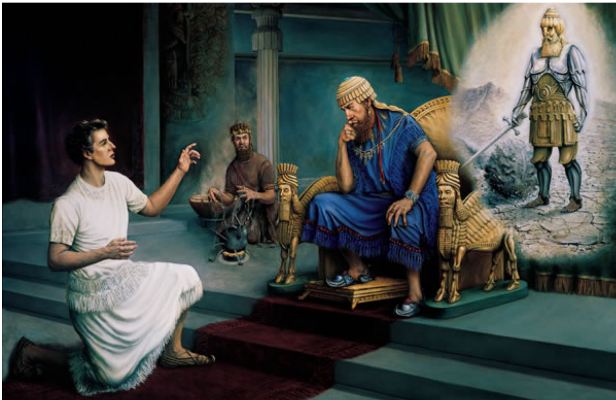
Daniel and Nebouchodonosor

“Then Nebouchodonosor was filled with anger, and the appearance of his face was distorted against Sedrach, Misah and Abdenago. And he said that the furnace should be stoked up sevenfold until it would be heated completely and told men, strong in strength, after they had bound Sedrach, Misah and Abdenago, to throw them in the fire... And they were walking around in the middle of the flames, singing hymns to God and blessing the Lord... But the angel of the Lord came down into the furnace... and shook the flame of the fire out of the furnace and made the inside of the furnace as though a moist breeze were whistling through. And the fire did not touch them at all and caused them no pain or distress... And Nebouchodonosor heard them singing hymns and was astonished. And he rose up