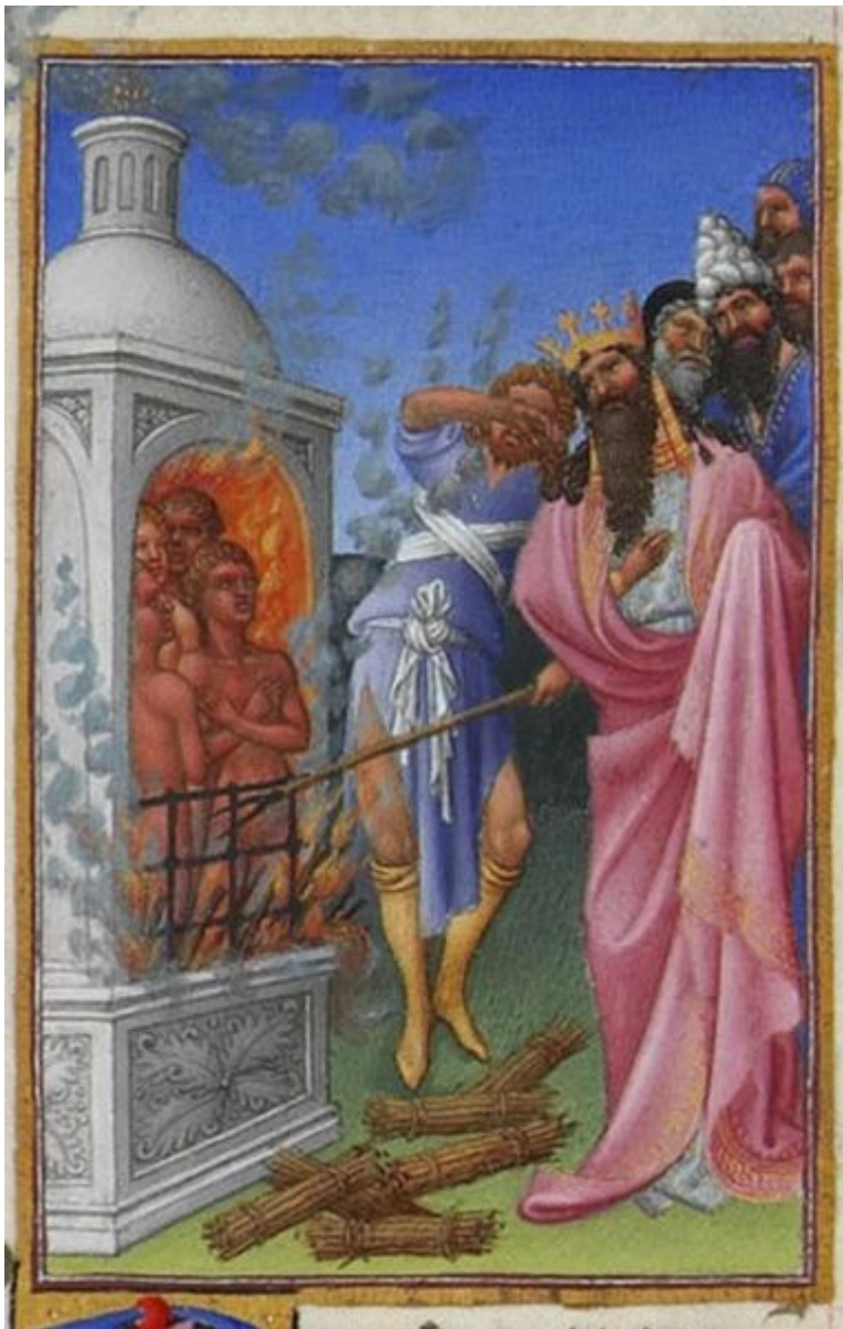
The three holy youths cast into the fiery furnace

that the author of Daniel is making a theological point with this statement, “son of God”? We must also ask: “Is it not possible that Nebouchodonosor was divinely inspired to say what he said?” Some Christians argue that since Nebouchodonosor was a pagan and not a prophet of God, this is not possible. They would do well to remember the narrative concerning Balaam and the Angel of the Lord in Numbers 22, when God speaks through Balaam’s donkey. If God can speak through a dumb animal, then can He not speak through a pagan if He so chooses?