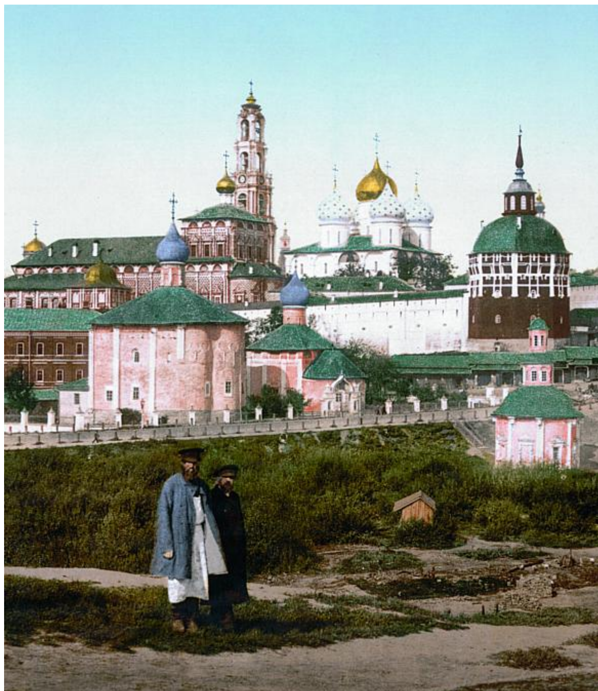
Lavra of Saint Sergius, the place where the Holy Martyr Silouan was killed

He himself considered his spiritual contact with Saint Maximos to be a godsend. In admiration of the Elder's abilities, Saint Silouan rightly called him a treasury of wisdom, for his knowledge of three languages (Greek, Latin and Russian) and as the author of heroic, elegiac poems and because he stood out amongst his contemporaries for his intelligence and perspicacity. This tribute is mentioned in the introduction of the translation of Saint John Chrysostom's interpretation of the Gospel according to Saint Matthew, a book he wrote with the assistance of Saint Maximos in 1524. He mentions this help in a very self-effacing fashion, and attributes the translation to his Elder, even though he expended a great deal of effort over it. His disclaimer doesn't bear scrutiny, however, since Saint Maximos