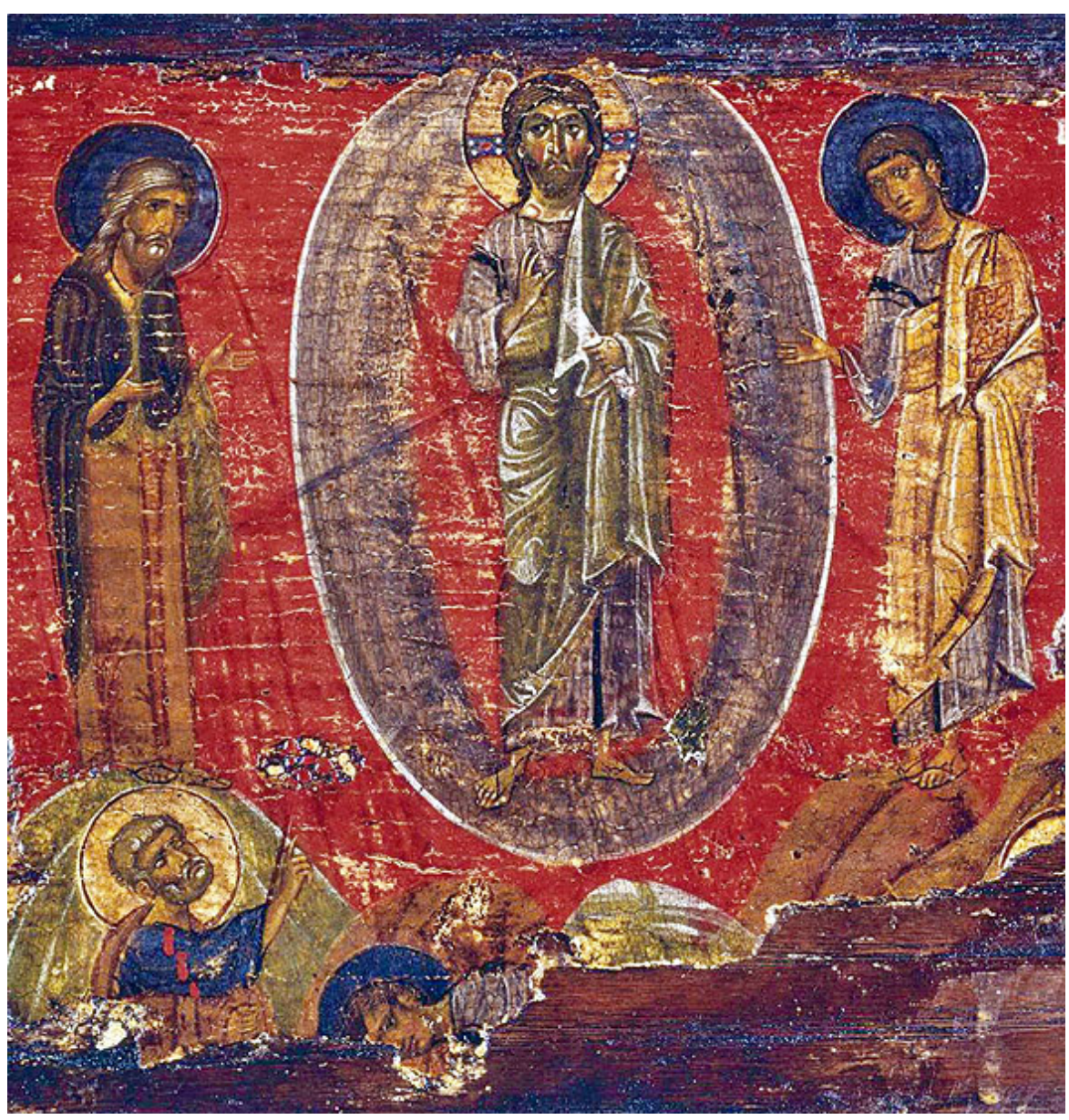
The Transfiguration, byzantine icon, 12th Century

The story of our creation in Genesis is interrupted. The Divine Council says, "Let us make man in our own image," and the work begins. But man's creation is not like the creation of anything else. For the stars and trees, the earth and the sky, God says, "Let there be...!" And so it is. God looks at what He has made and declares, "It is good." But for man, there