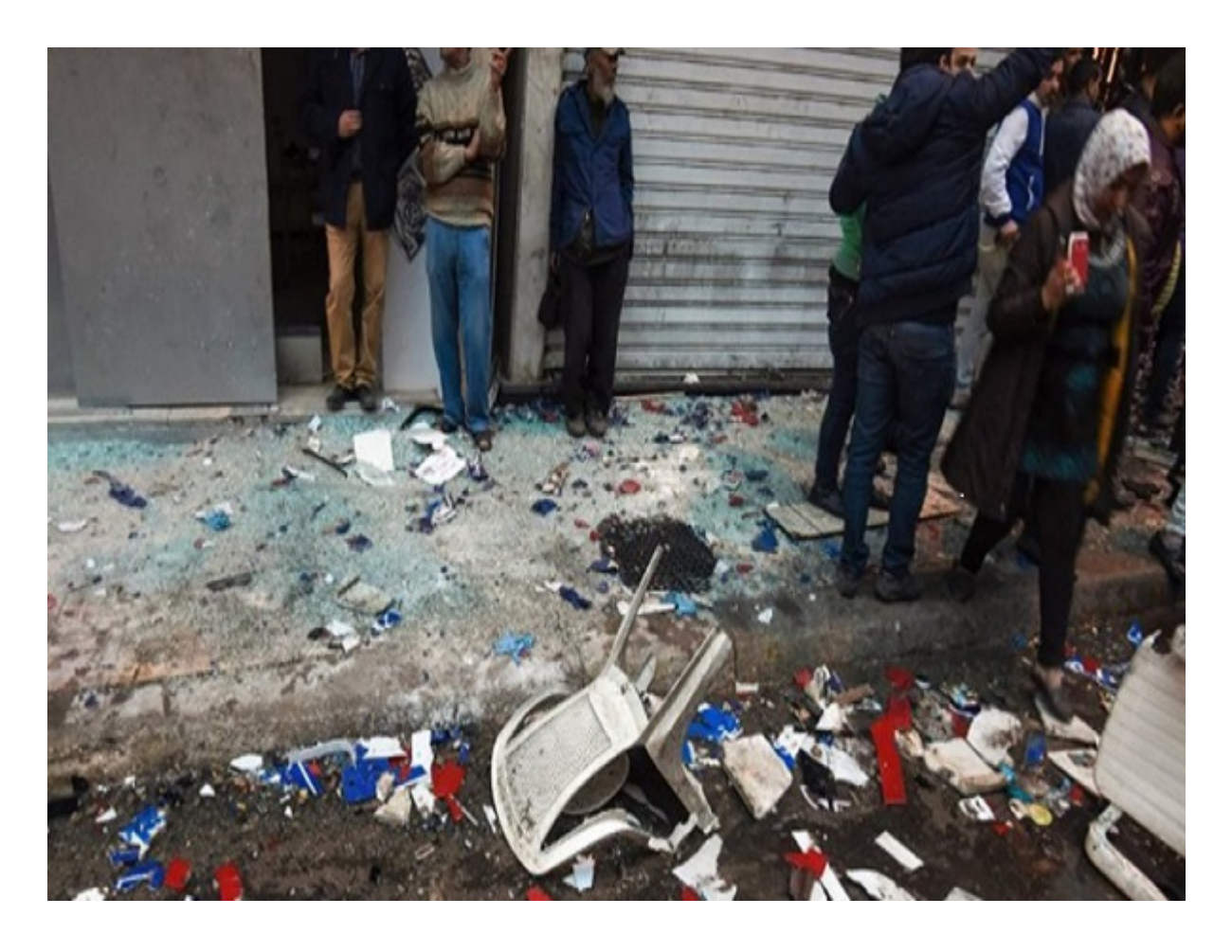
Monday, December 4, 2017 - Day One